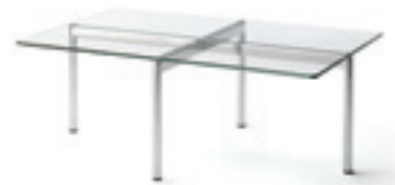
852 F Lounge table rectangular Measurements in mm B= 1110 D= 700 H= 400