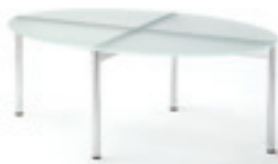
856 F Lounge table oval Measurements in mm B= 1100 D= 700 H= 400