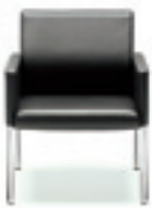
810 F Easy chair Measurements in mm B= 650 D= 680 H= 815