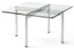
850 F Lounge table square Measurements in mm B= 700 D= 700 H= 400