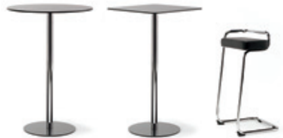
858 F Bistro table square Measurements in mm B= 640 D= 640 H= 1100