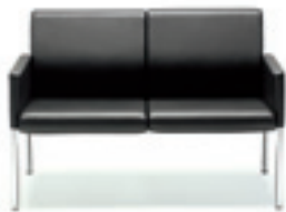
820 F Double sofa Measurements in mm B= 1215 D= 680 H= 815