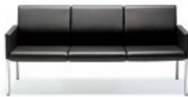
830 F Triple sofa Measurements in mm B= 1765 D= 680 H= 815