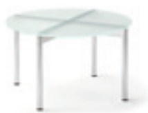
854 F Lounge table round Measurements in mm D= 700 H= 400