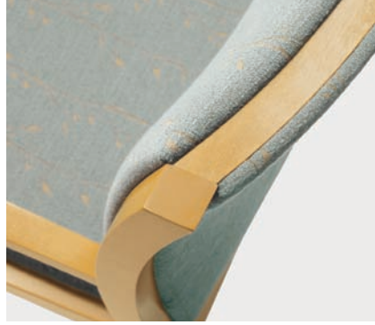
The exposed wood top rail exemplifies Beo's graceful aesthetic.