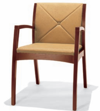
K58HH Button Back 22¼" W 25⅝" D 32¾" H