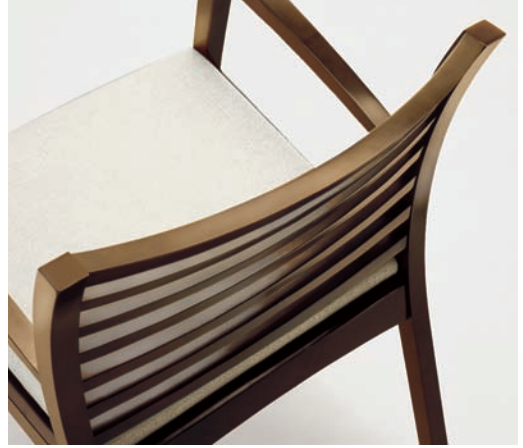
Each horizontal slat is individually shaped and hand set to support the lower back.