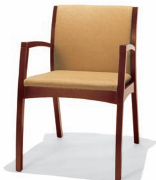
K58EE Fully Upholstered Back 22¼" W 25⅝" D 32¾" H