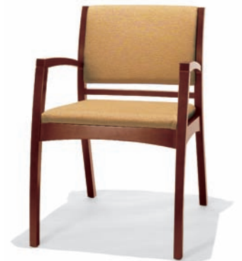
K58AA Half Back 22 \frac{1}{4} " W 25 \frac{5}{8} " D 32 \frac{3}{4} " H