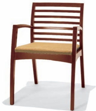
K58CC Ladderback 22¼" W 25⅝" D 32¾" H