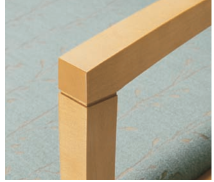
Inscribed reveals where the arms join the leg uprights confer simple sophistication.