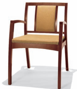
K58DD Vertical Insert Back 22¼" W 25⅝" D 32¾" H