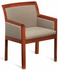
83311 Mid-back, upholstered 23 3 / 4 W 24D 31H