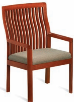
83308 High Back, slat 23 3 / 4 W 24 1 / 4 D 37H