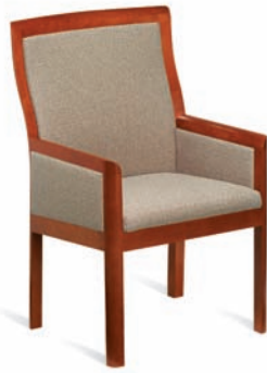
83310 High Back, upholstered 23 3 / 4 W 24 1 / 4 D 37H