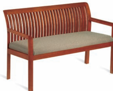
83422 Bench, slat back 47W 23 3 / 4 D 31H