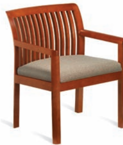
83309 Mid-back, slat 23 3 / 4 W 24D 31H